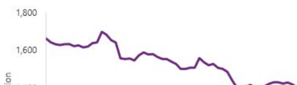
Figure 1: Age-standardised death rates for rolling periods of four quarters

If you are reading this then you might also have read my first piece for UK Column , showing that, astonishingly, zero doctors or nurses of non-retirement age (20–64) died 'involving' Covid-19 in Scotland in three years of an alleged pandemic, despite mainstream reports to the contrary. It really was a revelatory moment for me in my understanding of what has been going in since 2020, and proved that my initial instinctual thoughts that something isn't right were indeed accurate.